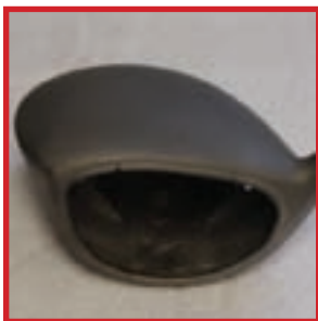
Golf Club Head

The vigorous stirring that is inherent in the ISM process is another advantage versus the VASC equipment. With little or no stirring in the VASC melt pool, homogeneity of alloying elements is difficult to achieve and is another reason for 'double melting' of charge material. In ISM, the four quadrant stirring generated by the induction field promotes uniform alloy composition and allows for dense, high melting point alloying elements to dissolve and be dispersed evenly. This allows for more complex alloys to be melted using the ISM process. The original patent holder alone is claimed to have cast more than 3000 different alloys.