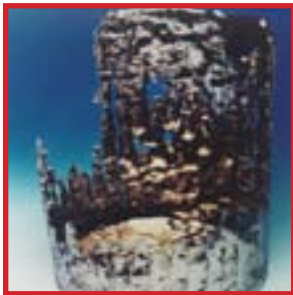
Skull after pouring

The ISM process has some inherent advantages over the Vacuum Arc Skull Casting (VASC) process that has traditionally been used in many titanium and reactive metal casting applications.