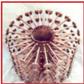
Centrifugal Cast TiAl Engine Valves

The biggest advantage is in the flexibility of the charge material that can be used. A cylindrical electrode must be fabricated for use in the VASC furnace. A large amount of effort and expense goes into producing the electrode needed at the beginning of the process. Compacted sponge, other raw material, and alloying elements are compacted and welded together to form the electrode. In addition, 'double melts' of the same material must be done in order to meet quality requirements in many applications. In this situation, an electrode is welded together then remelted in a VAR. The resulting fully dense ingot is then re-used as the electrode in the VASC process again.